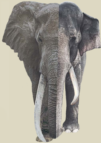
16TH INTERNATIONAL ELEPHANT CONSERVATION & RESEARCH SYMPOSIUM

Presented by International Elephant Foundation Hosted by Adventures with Elephants