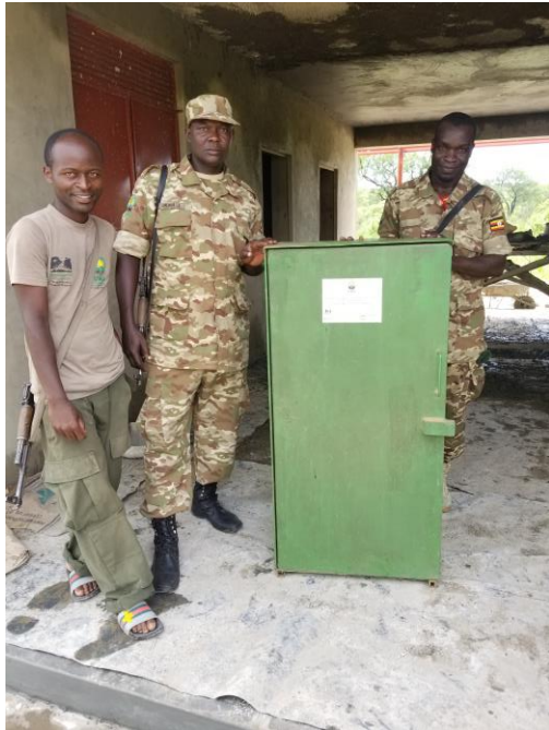
Delivered and installed the Waiga gun cabinet