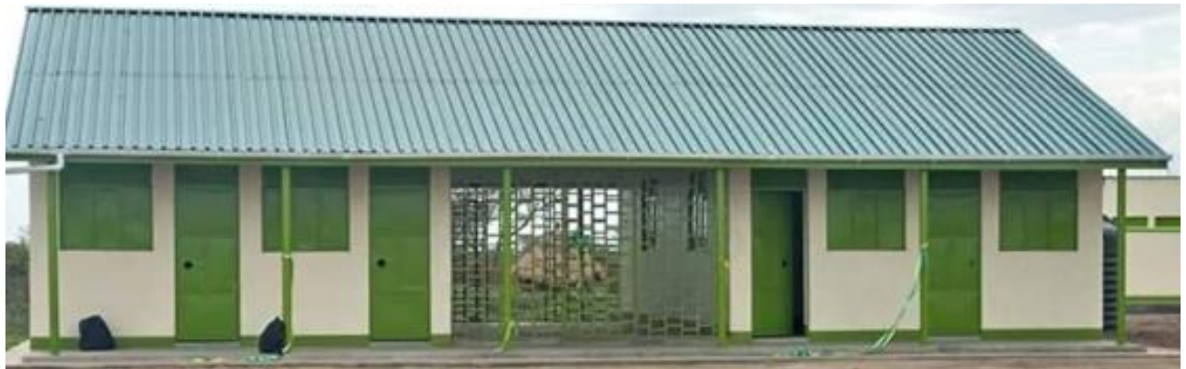
The completed Waiga Ranger Post